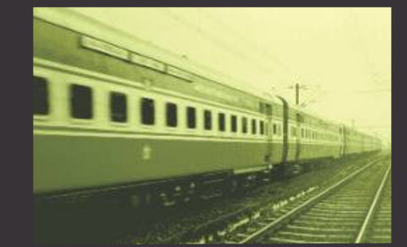
3 Min. From Jaipur Junction