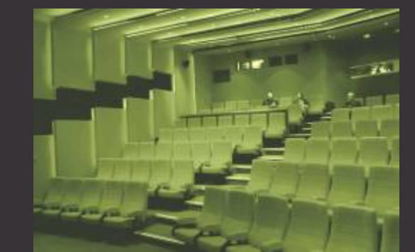
2 Min. From Movie Theater