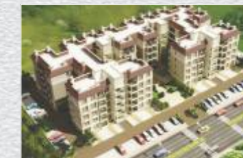
Celebrations @ Tonk Road, Jaipur