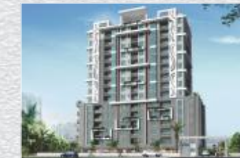
Indus @ Mansarovar, Jaipur