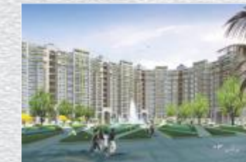
Harmony @ Jaipur-ajmer expressway, Jaipur