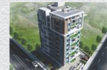
Aranya @ Sodala, Jaipur