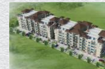
Ecoscape @ Patrakar Colony, Jaipur