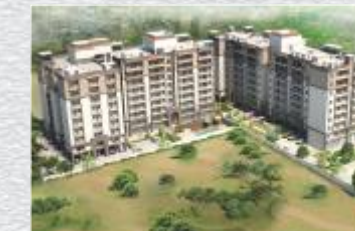
Orchid @ Jaipur-ajmer expressway, Jaipur

CONSUMER CHOICE AWARD FOR HIGHEST SATISFACTION & EXCELLENCE IN DESIGN & SPACE MANAGEMENT - COMMERCIAL