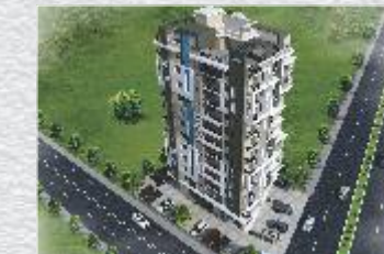
UDB Skyway - I @ Main Sikar Road, Jaipur