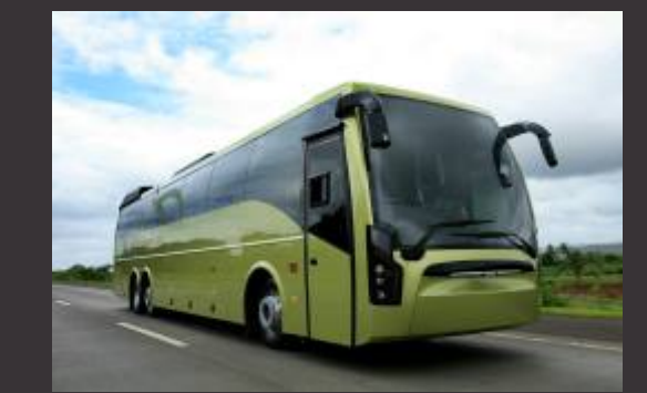
3 Min. From Sindhi Champ Bus Stand